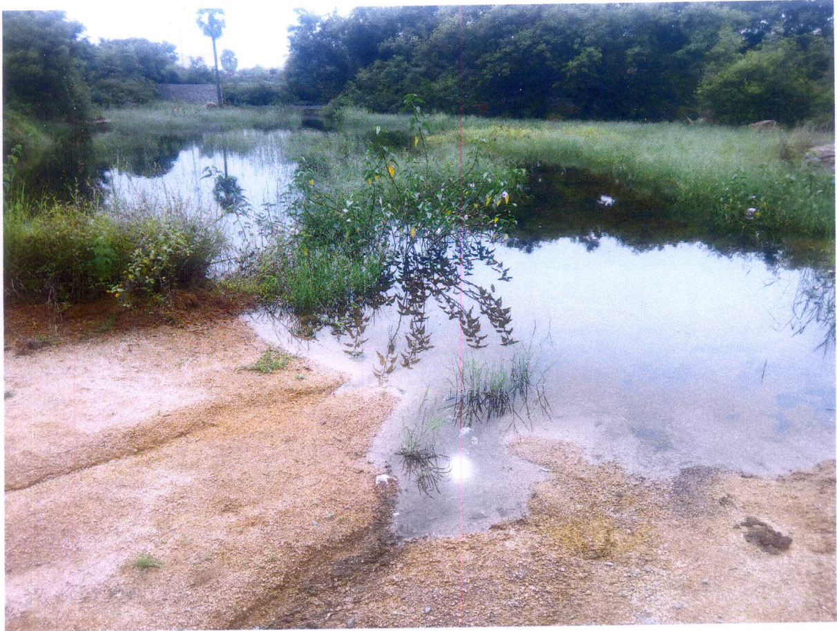
WATER BODY IN MANUU CAMPUS NEAR BOYS HOSTEL