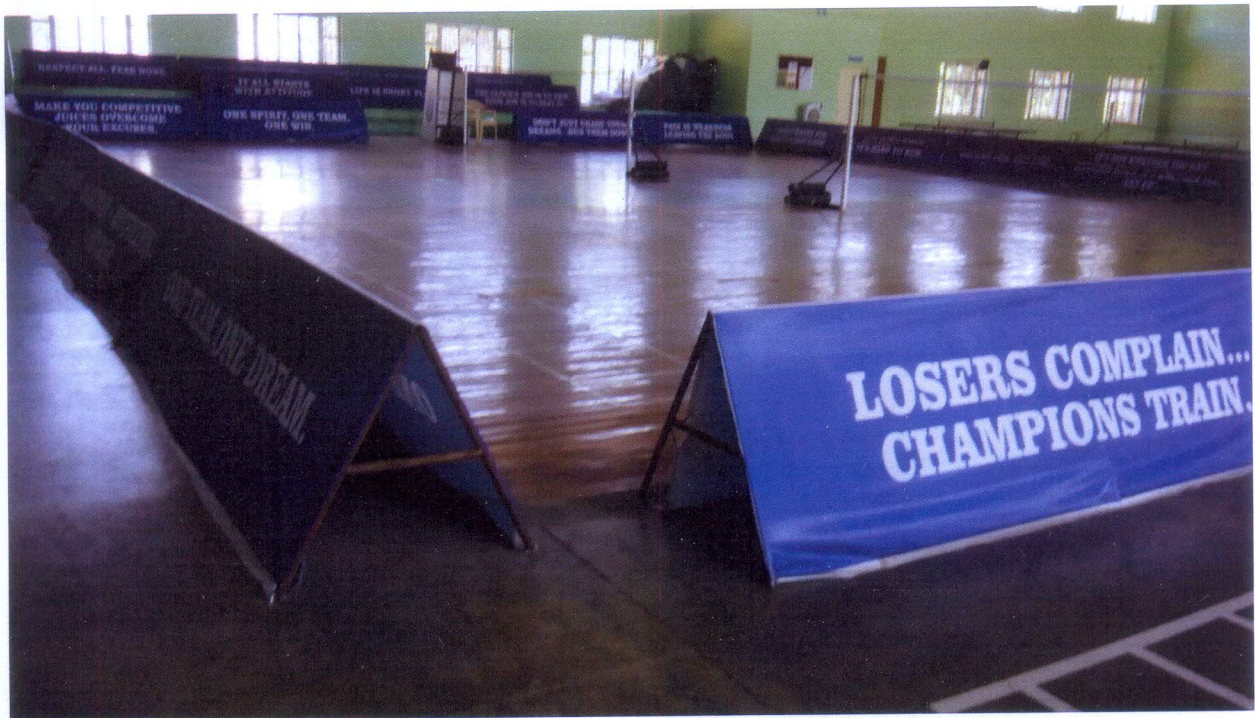
The scrap in the ITI is utilized in the University indoor stadium for making the stand for holding.