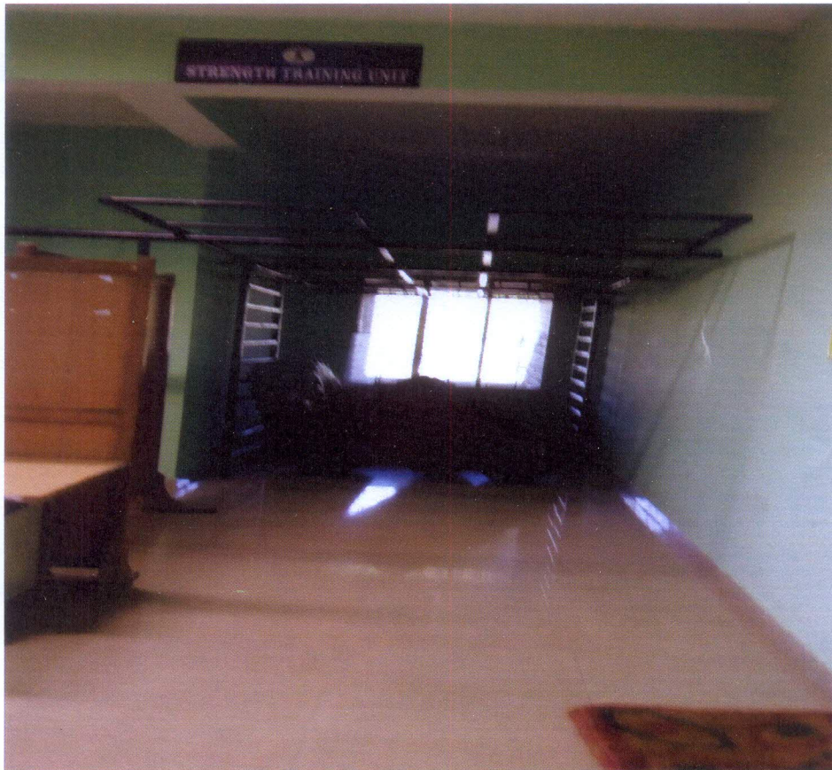
The scrap in the ITI is utilized in the University indoor stadium for making the stand for holding.